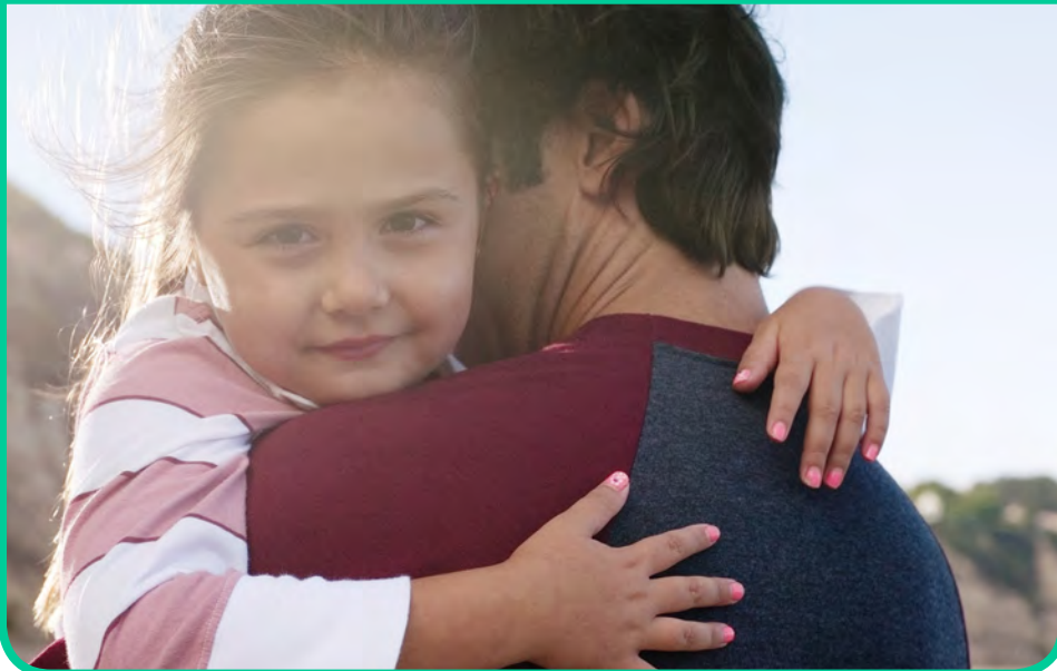
Image Credit sb10068249s-001, Siri Stafford, DigitalVision, Getty Images

When you feel calm , you do not feel worried, scared, or angry.